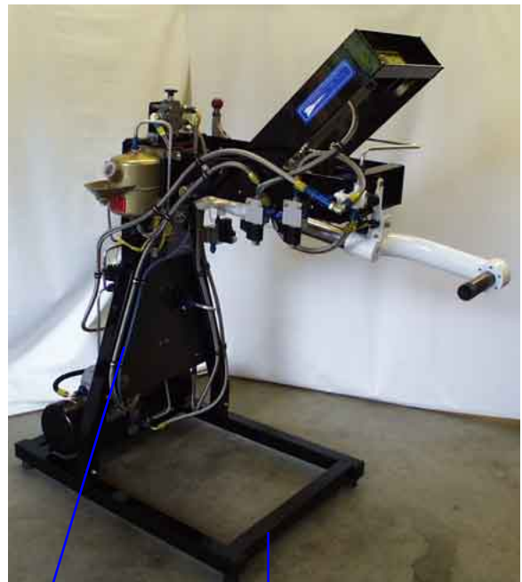
Front Panel/ controls