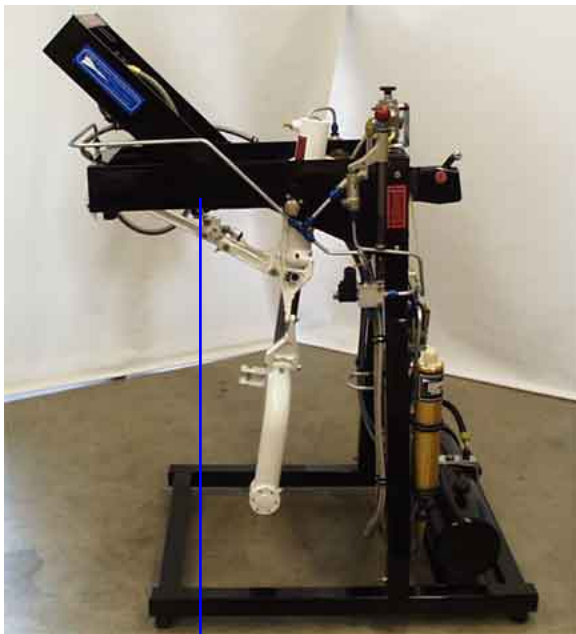
Strut and support

The HYD2 Trainer is a fully functional hydraulic system incorporating various actuator units, accumulator, reservoir, filter, selector unit, constant displacement pump, pressure control valve, and related valves and components to provide an understanding of a typical aircraft hydraulic system. The system also serves the function to provide experience for component removal and replacement, line fabrication, and troubleshooting.